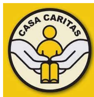
Illonka Steyn (37) 22 January 2023

Each applicant is evaluated on merit. Please apply to ceo@casacaritas.org.za .